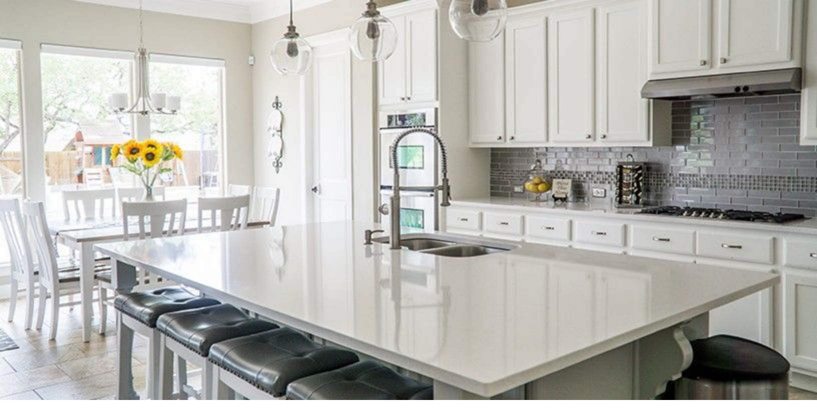
QUARTERLY MARKET REPORT